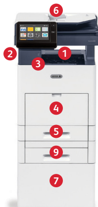
Xerox® VersaLink B605 Multifunction Printer Print. Copy. Scan. Fax. Email.