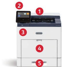
Xerox® VersaLink B600 Printer Print.