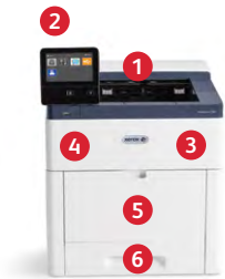
Xerox® VersaLink® C500 Color Printer Print.