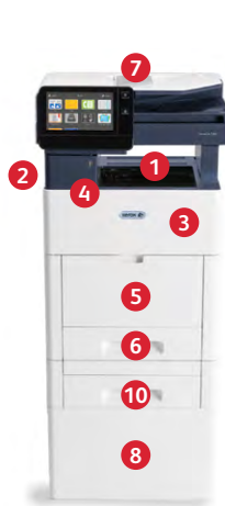
Xerox® VersaLink® C505 Color Multifunction Printer Print. Copy. Scan. Fax. Email.